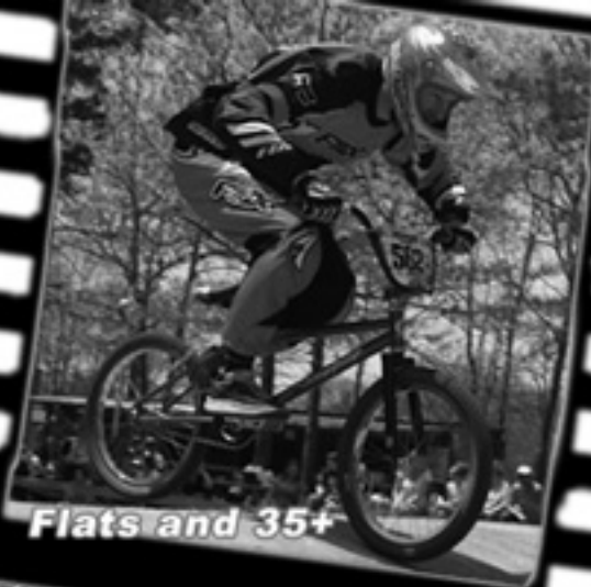
Flats and 35+