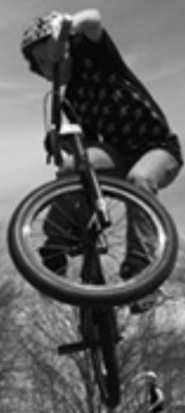
Small - Big Style