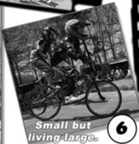
Small but living large.