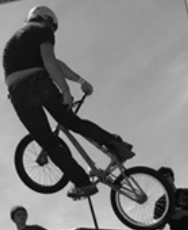
Fakie On Deh Hip