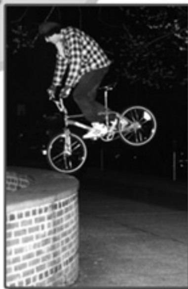
New Brunswick Street Ride About 1988-89.

(I believe my shoe is half off as well.)