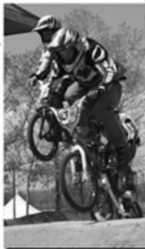
Tantum - Moore

6 Races To Go BMX racing fiends. Who do you think will get the title?