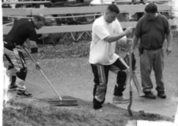
Les and deh boys...