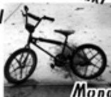
Beginner bike Mongoose Motomag 1979