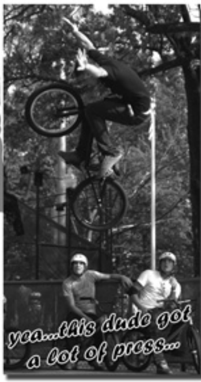
yea...this dude got a lot of press...