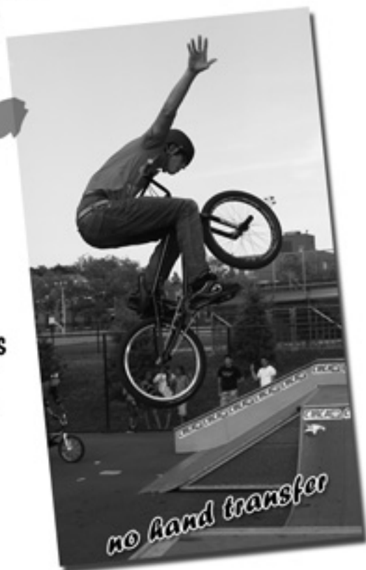
no hand transfer