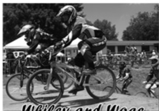
Whiley and Wogs Best races of the day