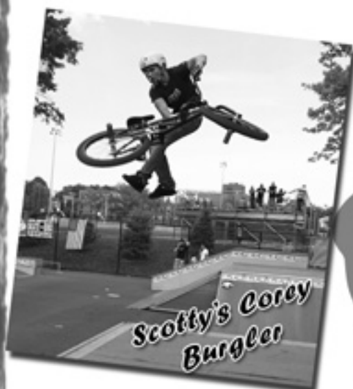
Scotty's Corey Burger

501 OLD POST ROAD EDISON, NEW JERSEY 732-650-9449