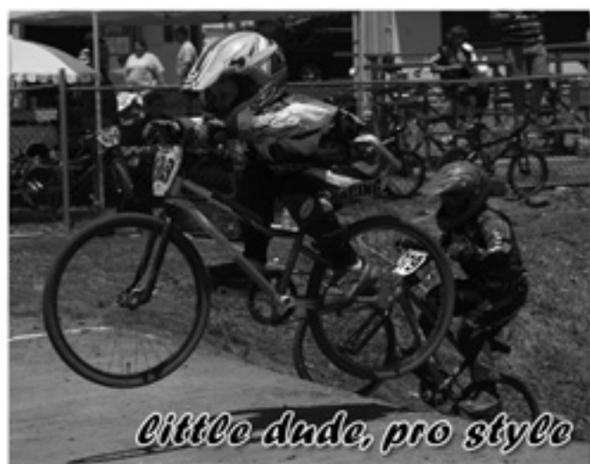
little dude, pro style