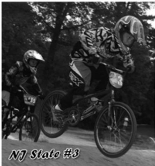
NJ State #3

central Jersey BMX NBL NJBMX 2007 state Qualifiers 6 & 7