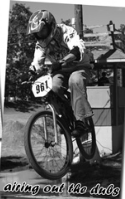
airing out the dubs