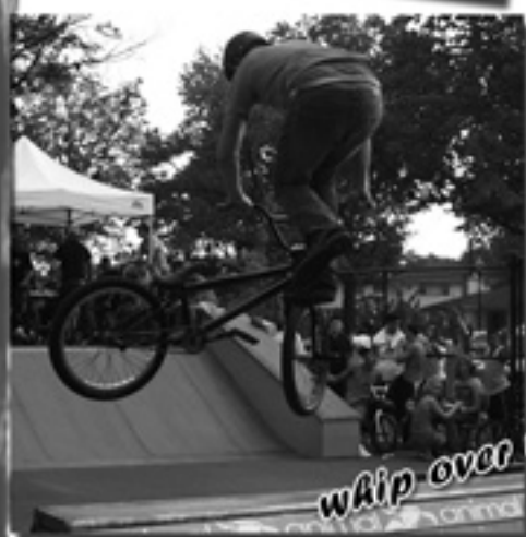
Whip over the spine