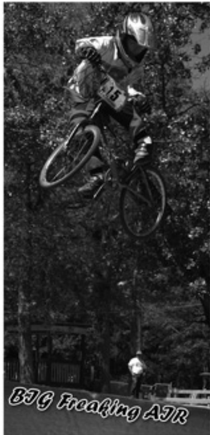
BJG Freaking AJR