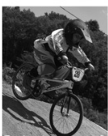
Dulock race mode