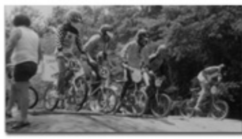
Old school "random gate start" at CIBMX circa 1982.

Your's truly is #28 wearing his Jag World Championship t-shirt.