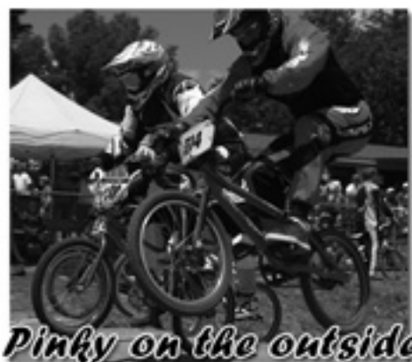
Pinky on the outside

Hunterdon County BMX 2007 NBL State Qualifiers 4 & 5 July and Hyper Pro-Am