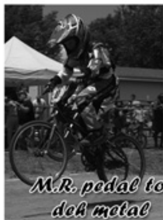
M.R. pedal to deh metal