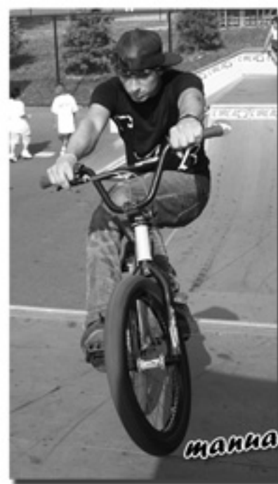
manuals in yo face