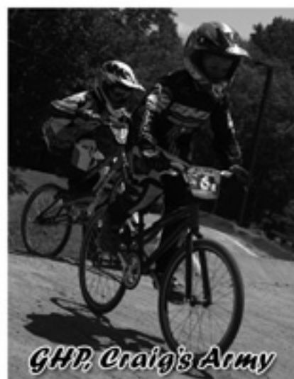
GHP, Craig's Army