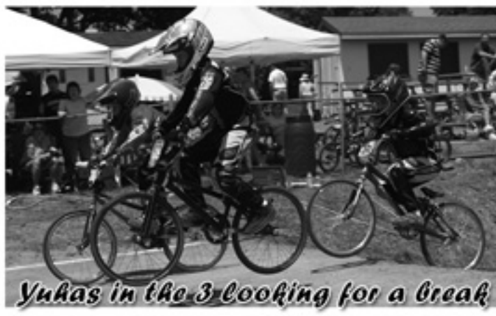
Yukas in the 3 looking for a break