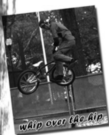
Whip over the lip

AI from CJS was at it again this summer, pumping up the NJ freestyle scene with 2 more comps at Perth Amboy SkatePark this year during July and August, these are some shots from Round 1 in July. Props to the CJS crew, ;-)